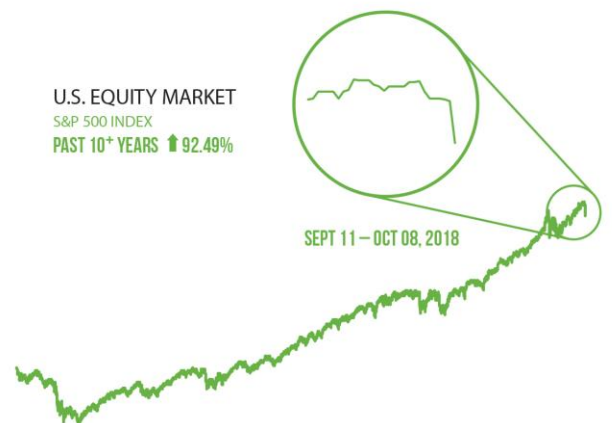
U.S. EQUITY MARKET S&P 500 INDEX PAST 10+ YEARS ↑ 92.49%